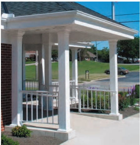
SQUARE SMOOTH COLUMNS