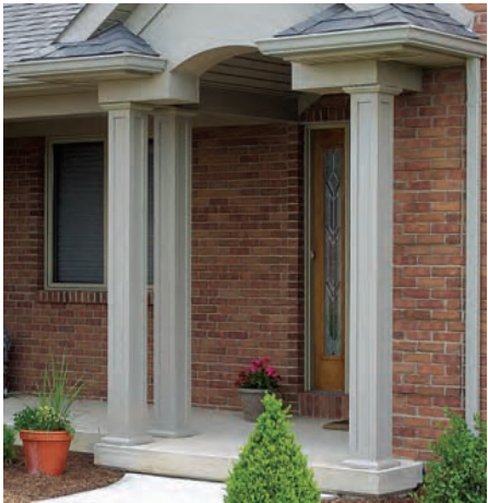
SQUARE PANEL COLUMNS