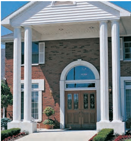
ROUND FLUTED COLUMNS

Cut the staves (sections) of each column to size, then snap or lock them together. For one-piece aluminum caps and bases just slip the columns into the cap and base. For the two-piece aluminum puzzle-lock or the two-piece polymer composite cap and base simply join the mating halves together around the column. Easy to follow step by step assembly instructions are packaged with each column. General installation instructions are also shown on the back cover.