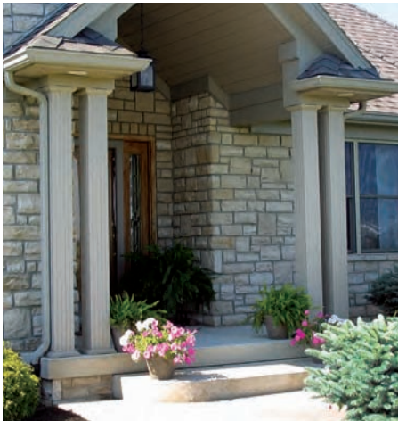
SQUARE FLUTED COLUMNS